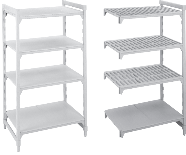
Stationary Starter Unit