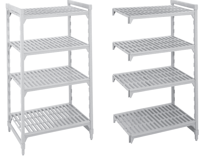
Stationary Starter Unit