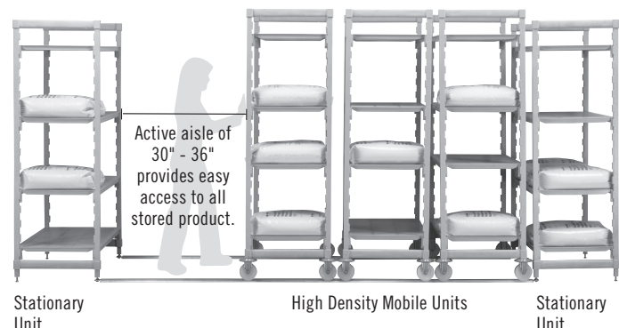
High Density Storage Floor Track System