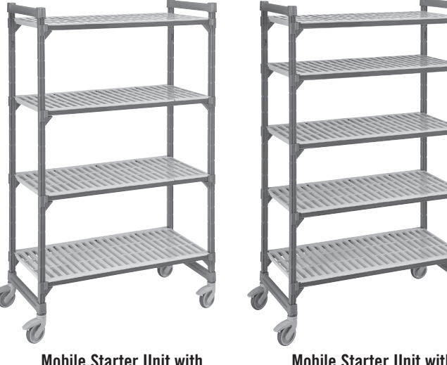
Mobile Starter Unit with 4 Vented Shelves